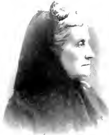
MARY CLEMENT LEAVITT.

LEAVITT, Mrs. Mary Clement , missionary temperance organizer, born in Boston, Mass. She comes from an old New England family prominent in the early days of the Colonies. She was edu-